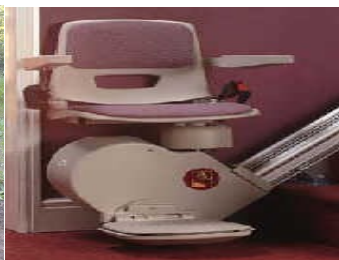
Stairlifts: Where stairs are a problem.