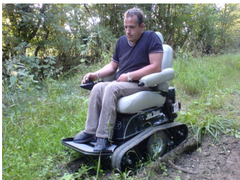
Trac About IRV 2000: Tracked go anywhere Powered Wheelchair.