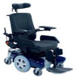
Powered Wheelchairs: Indoor, Indoor/Outdoor and Outdoor.