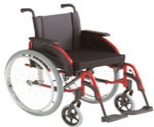
Manual Wheelchairs: From basic to fully configurable lightweight models.