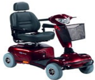
Scoters: From compact fold up designs to large 8mph models.