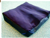
Cushions and Aids for daily living.